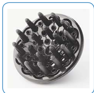
Soft finger volume diffuser